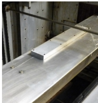
Cleaning test at KIRRON GmbH & Co KG in Korntal-Münchingen

The excellent product features of KIWOCLEAN EL 9100 MC/9180 MC have been tested and confirmed by leading manufacturers of soldering furnaces. The cleaners are supplied in an original box of 12 x 1-litre spray-bottles and 12 spray nozzles.